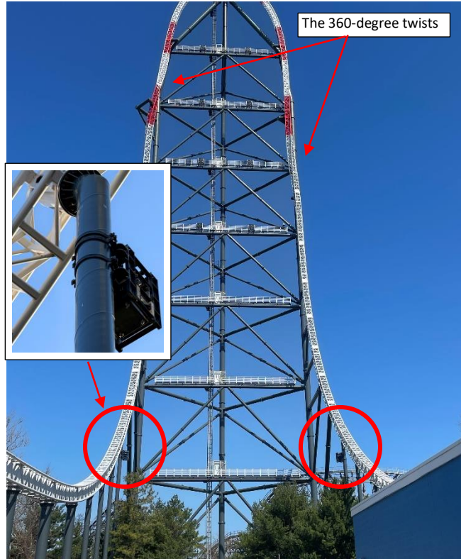
Figure 1 The track system and the TMDs installed on two of the support columns

As the roller coaster train navigates the 360-degree twists near the summit of the track, it generates significant dynamic forces that act as the primary source of vibration exciting the structure's principal mode, specifically triggering a harmonic response where the support columns undergo bending oscillation.